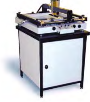
SPR-45 automatic printer with stand option

Model SPR-45 has the same features as the SPR-40, but is more automated with its power sweep squeegee and power frame lift for higher volume runs. Even for fine pitch applications, friendly precision controls make operation of these systems simple and easy.