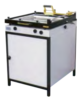
SPR-25 with stand option