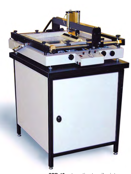
SPR-45 automatic stencil printer with stand option